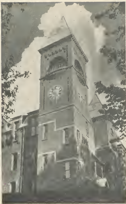
THE CLOCK TOWER